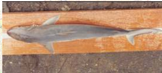
46. Family: Squalidae Species: Carcharinus sp. FAO names : EN-Shark FR-Requin Local name : Shark Size : near 100cm Fishing gear : long lines, bottom set nets Habitat : pelagic in warm oceanic waters