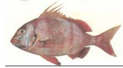
48. Family : Sparidae Species : Pagrus ariga , (Valenciennes, 1843) FAO Names: EN : Red banded seabream Fr : Pagre rayé Size : 40-60cm Fishing gear : Long line and bottom set nets Habitat : trawlers coastal rocky bottoms with sand up to 170m depths