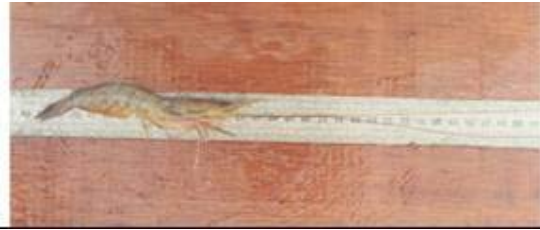
43 Family: Palaemonidae Species: Macrobrachium sp. Local name : Njanga Size : 11cm Fishing gear : basket traps Habitat : fresh and brackish water