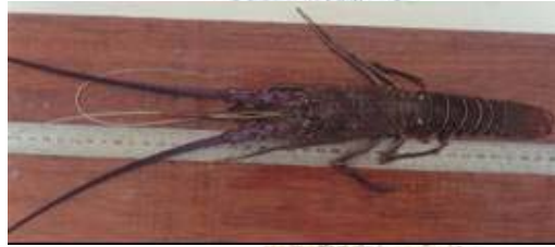
45. Family: Palinuridae Species: Panulirus sp. FAO names : EN-Spiny lobster FR-Langouste Locale name : lobster Size : 22cm Fishing gear : bottom set nets, bottom trawls Habitat : Shallow coastal waters from 5-40m depth on rocky and sandy bottoms.