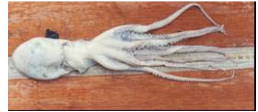
47. Family : Sepiidae Species Sepia elobyana Adam, 1841 FAO names : EN-Guinean cuttlefish FR- Seiche de Guinée Local name : Cephalopods Size : 6cm maximum Fishing gear : bottom trawlers by-catch, bottom set gill nets Habitat : coastal marine and brackish waters etc.